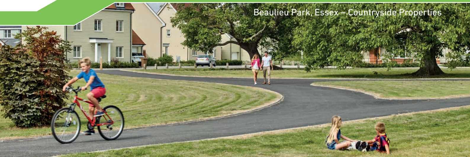
Beaulieu Park, Essex – Countryside Properties